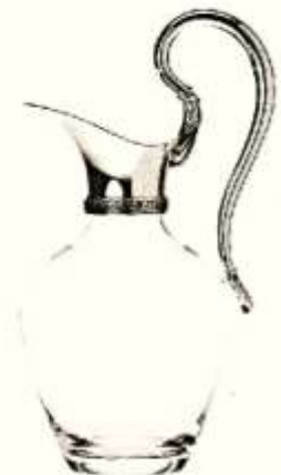
The crystal glass wine carafe from Christofle's Malmoson collection features a beautifully crafted silver-plated border with stylised palm leaves and a curved handle (RM5,510)