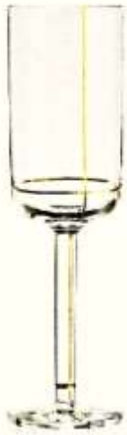
Deliver the perfect toast with this champagne glass embellished with gold lines from Smuk Living (RM115)

The festivities of the holiday season may have drawn to a close, for now, but you do not always need a reason to catch up with family and friends. Have them over for an evening of games and cocktails, and be the perfect hostess. By Shalini Yeap