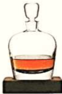
Store your drink for the evening in the Whisky Arran Decanter from Janine with a walnut base (RM794)