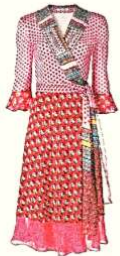
Play hostess in this lacy number – a colourful wrap-around dress from Diane von Fürstenberg (RM2,550)