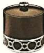
Keep ice cool in this luxurious ice bucket by Royal Selangor, made from dark rubber wood and embellished with pewter medallion designs (RM750)