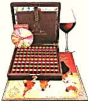
Explore a vast range of wines from around the world with the Aromaster, available at Wine Talk. It consists of 88 wine aromas, a manual, the wine aroma wheel booklet and a wine aroma board game designed by artist Yves Lemay. (RM1,750)