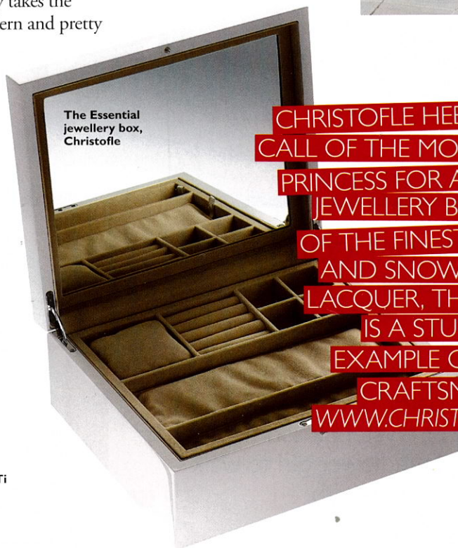
The Essential jewellery box, Christofle

CHRISTOFLE HEEDS THE CALL OF THE MODERN-DAY PRINCESS FOR A FITTING JEWELLERY BOX. MADE OF THE FINEST SILVER AND SNOWY WHITE LACQUER, THE ESSENTIAL IS A STUNNING EXAMPLE OF LUXURY CRAFTSMANSHIP. WWW.CHRISTOFLE.COM