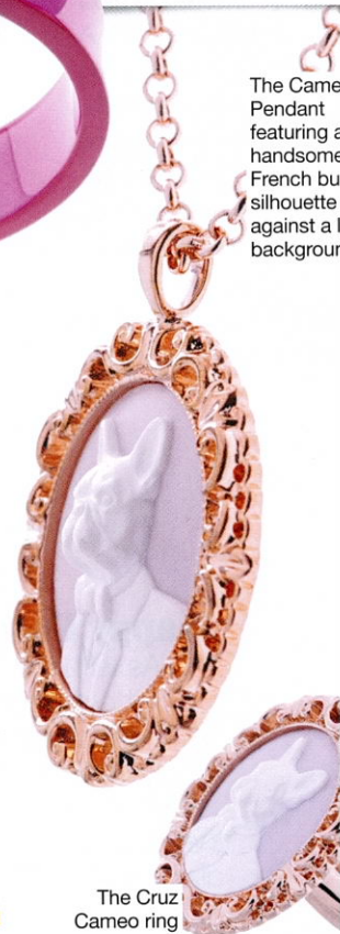
The Cruz Cameo ring