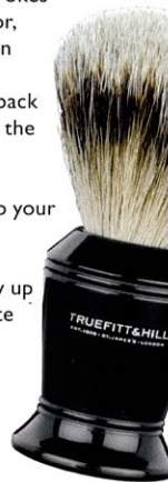
Truefitt & Hill Super Badger Shaving Brush, RM440