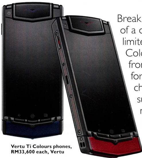
Vertu Ti Colours phones, RM33,600 each, Vertu

Break up the monotony of a dark suit with these limited-edition Vertu Ti Colours models. Made from grade 5 titanium for enhanced strength, choose between sunset red and midnight blue. Vertu, G35B, Ground Floor, Suria KLCC. Tel: 03-2166 7888.