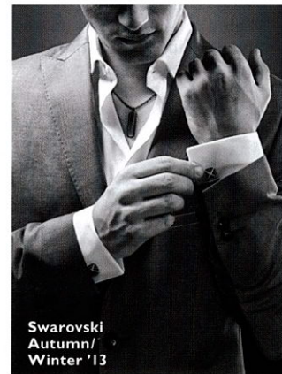
Swarovski Autumn/Winter '13

Break up the monotony of a dark suit with these limited-edition Vertu Ti Colours models. Made from grade 5 titanium for enhanced strength, choose between sunset red and midnight blue. Vertu, G35B, Ground Floor, Suria KLCC. Tel: 03-2166 7888.